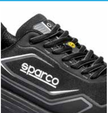
TEAMWORK TAPE printed on the tongue (15x60 mm). ESD mark printed on lace hooks.