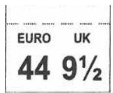
SIZE LABEL sewn between upper and tongue Size 17 x 14mm