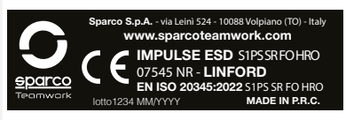
"CE" LABEL inside the tongue Size 50 x 15mm