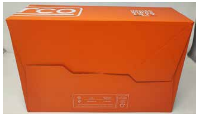
Cardboard SPARCO TEAMWORK SHOE-BOX. Protective inner tissue paper. Size: 343x188x123 mm Recycling info at the bottom (PAP20 - valid for Italy only)